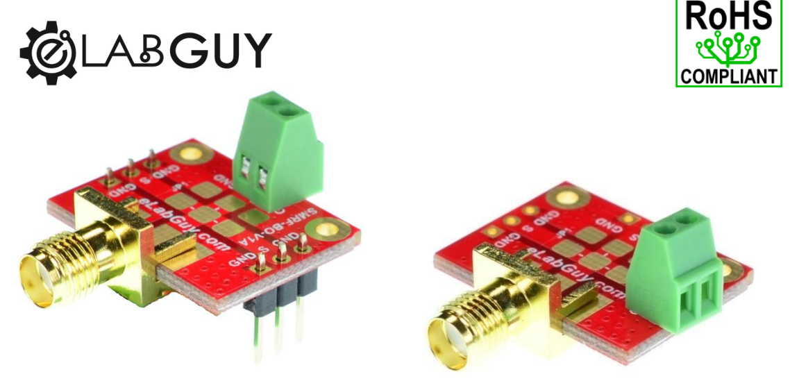
Figure 3: SMA-F-BO-V1A Various connections